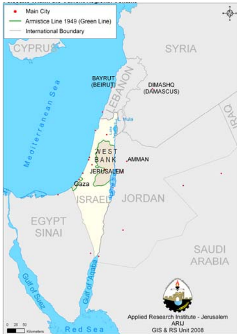
MAP 1. Palestine within the Current Regional Context

Applied Research Institute – Jerusalem (ARIJ) P.O.Box 860, Caritas St. Bethlehem, Palestine Tel: +972-(02)-277-0535 Tel: +972-(02)-274-1889