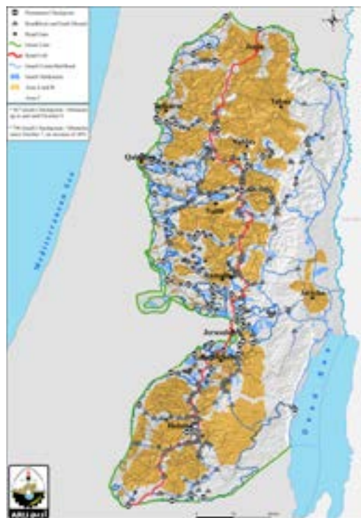
Geopolitical map detailing the Israeli army's strategic deployment of obstacles such as checkpoints and barriers across the West Bank, before and after October 7, 2023.

Bank. Combined with Israel's dominance over the bypass road network throughout the oPt, this obstacle regime has made movement between Palestinian governorates nearly impossible and severely hindered access to Jerusalem and areas inside the Green Line.